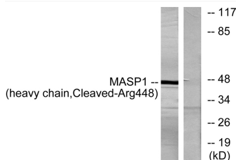
Western blot analysis of lysates from A549 cells, treated with etoposide 25uM 24h, using MASP1 (heavy chain, Cleaved-Arg448) Antibody. The lane on the right is blocked with the synthesized peptide.